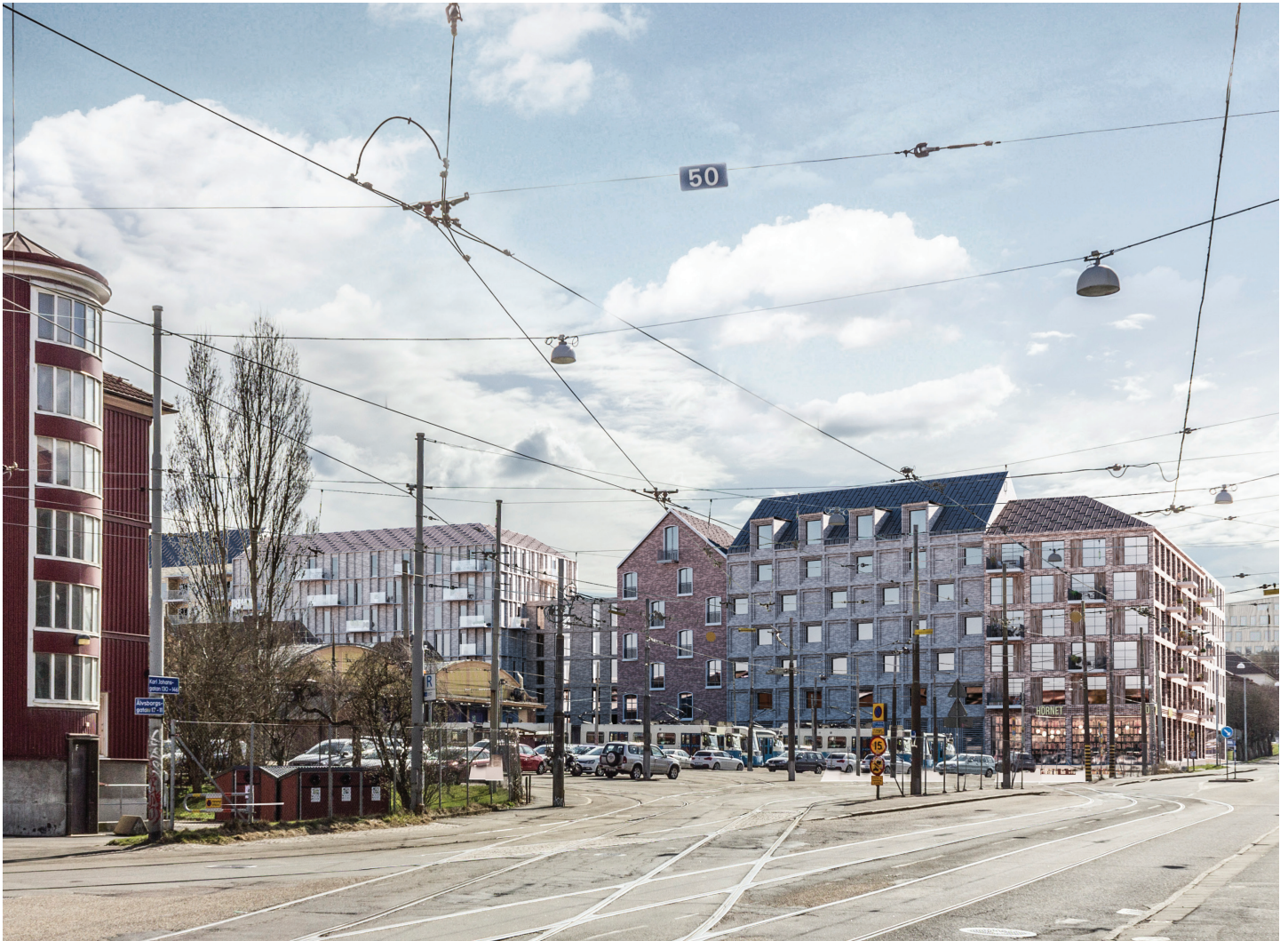
Illustration: Okidoki Arkitekter