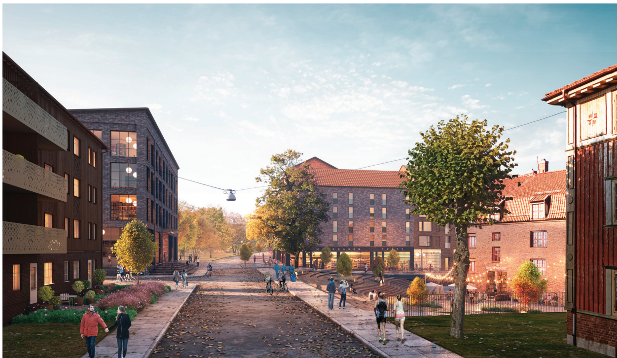
Visualisation of the street Ostindiegatan